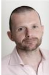
JRJ Global Growth