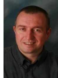
Grant Fritchey Chapters